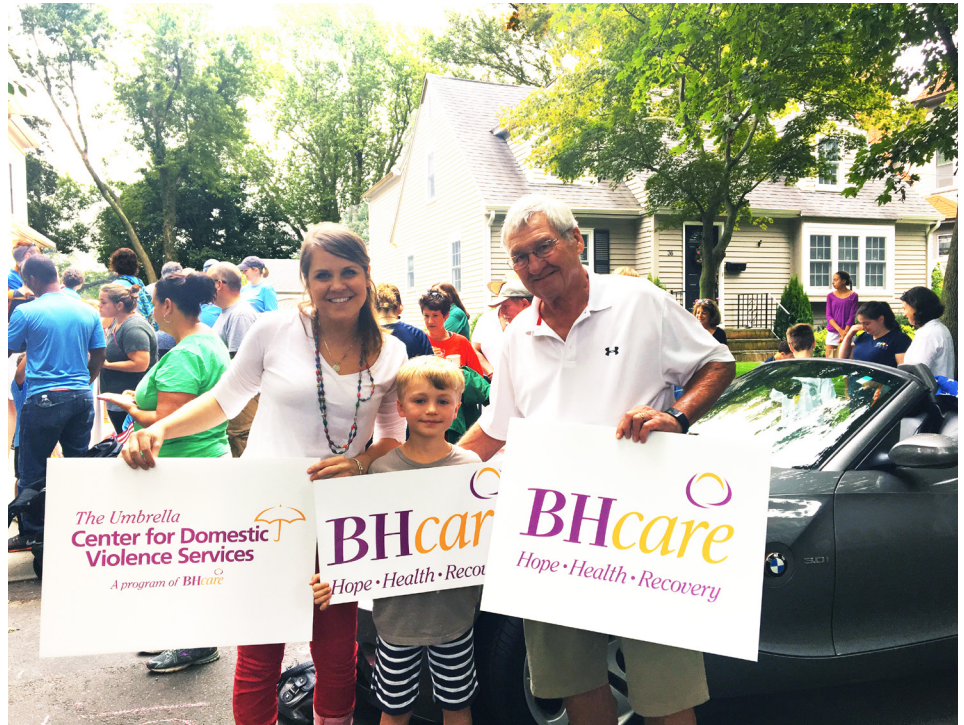
BHcare established the Birmingham Group Health Services, Inc. Fund in 2005 as part of VCF's Endowment Challenge.

BHcare provides services that address behavioral health, domestic violence, and drug and alcohol addiction to individuals and their families both in the Valley and along the shoreline. BHcare is the result of a 2012 merger between Birmingham Group Health Services