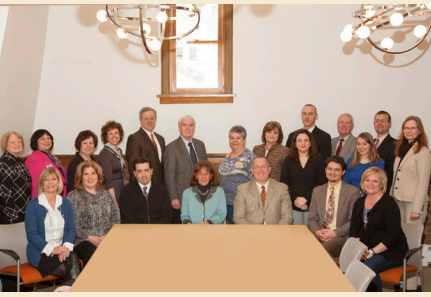
The Baseline Indicators Report Committee, at the Valley Community Foundation.

Community development and data collection: the two may not seem to have much in common,