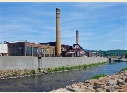
A public/private partnership formed in August 2014 at the 44-acre parcel that was home to the former Ansonia Copper & Brass Co. This site is now being demolished and remediated in stages.