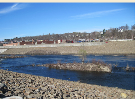
The Valley's industrial past is being reclaimed, as old factories along the Naugatuck River are transformed.