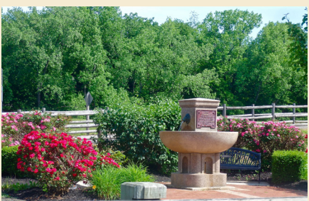
Recapturing industrial land adds recreational opportunities like this location at the north side of the Derby Greenway.

The Environmental Protection Agency classifies brownfields as real property, the expansion, redevelopment, or reuse of which may be complicated by the presence, or potential presence, of a hazardous substance, pollutant, or contaminant. The Lower Naugatuck Valley is largely dependent on reviving these sites for development and future growth. In fact, remediation, reclamation, and redevelopment could be considered the 3Rs of economic expansion when it comes to brownfields.