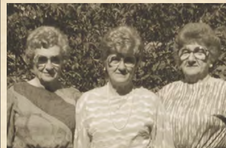
TORBI SALDAMARCO FAMILY FUND JUNE 2006