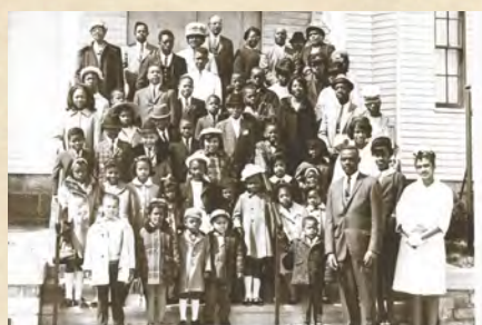
JULIAN A. TAYLOR SCHOLARSHIP FUND APRIL 2005