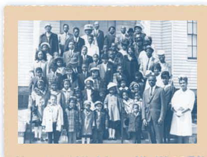
JULIAN A. TAYLOR SCHOLARSHIP FUND