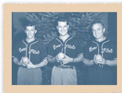
JOHN TYMA FUND